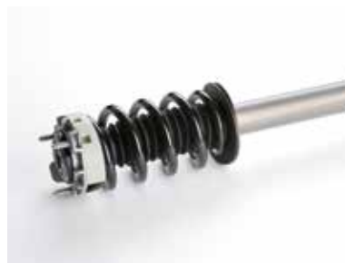
Highly sophisticated aluminum shock absorber