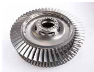
Aircraft engine turbine