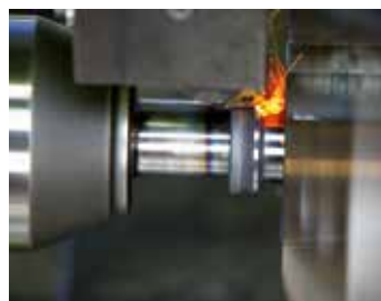
Removal of friction welding flash