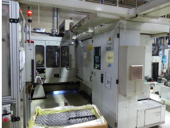
OP 20 MAUSER endmaching of Camshaft