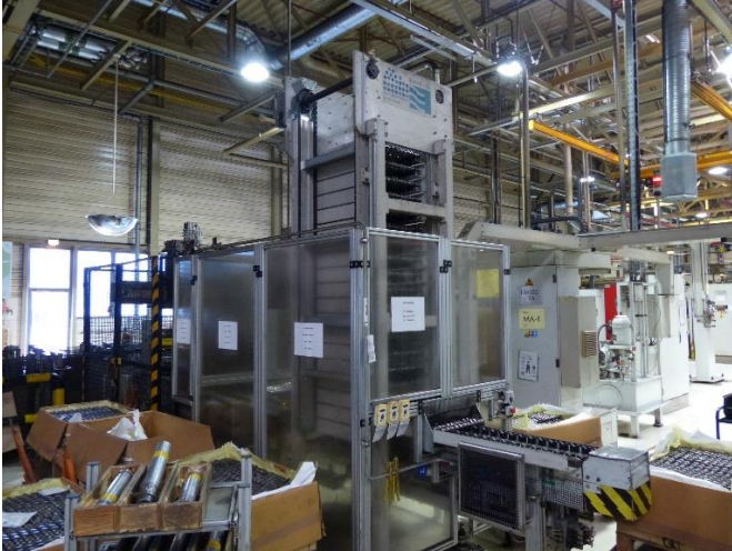
OP 10 Loading of raw Camshafts