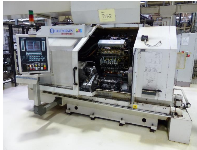
OP 70 THIELENHAUS Superfinishing