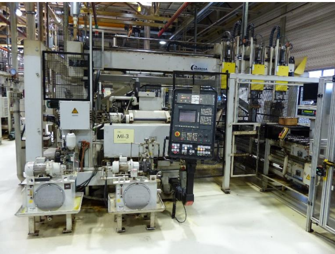
OP 50 SCHAUDT MIKROSA centerl. Grinder