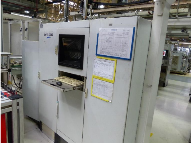
OP 100 OPTI-SENS Optical Check