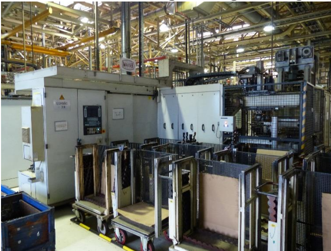
OP 40 MAUSER milling/drilling/turning