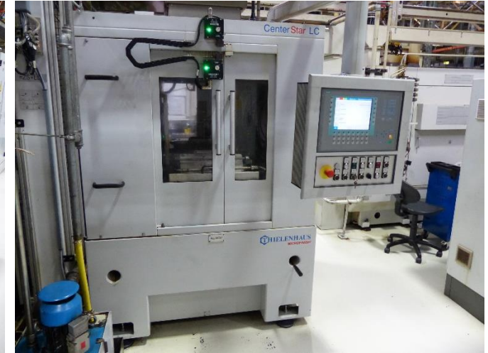
OP 65 THIELENHAUS Brushing Machine