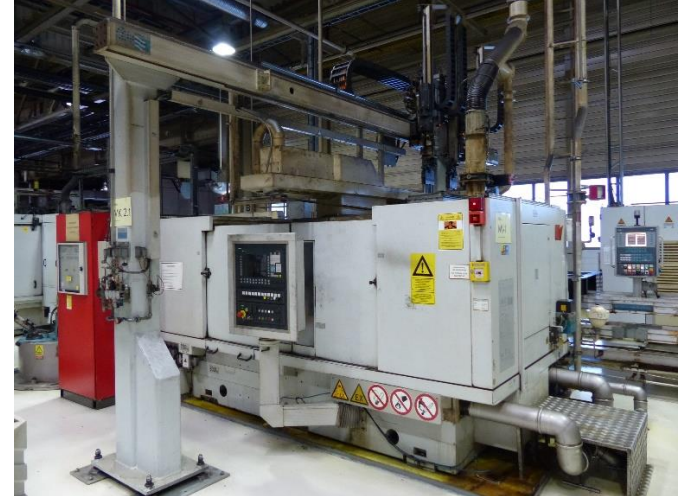
OP 30 SCHAUDT MIKROSA center. grinder