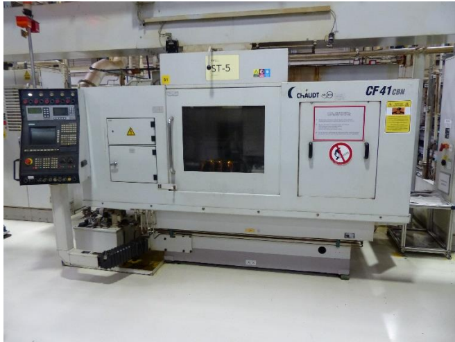
OP 60 SCHAUDT CF41 CBN Cam Grinder