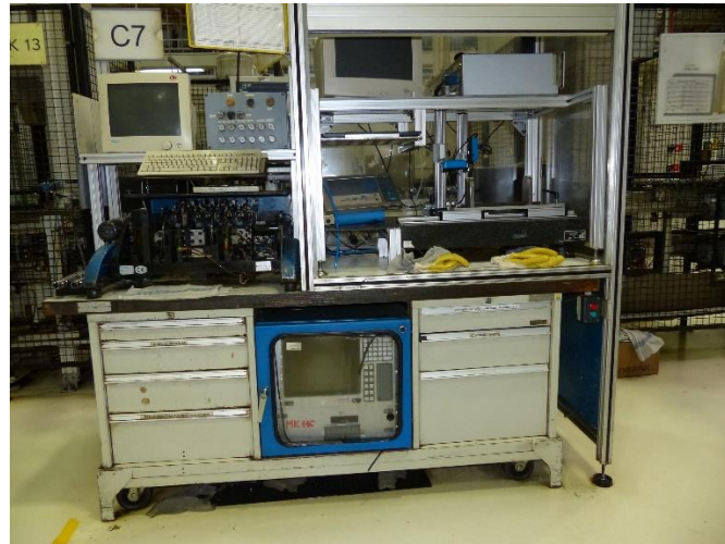
OP 70 HOMMEL Roughness Tester