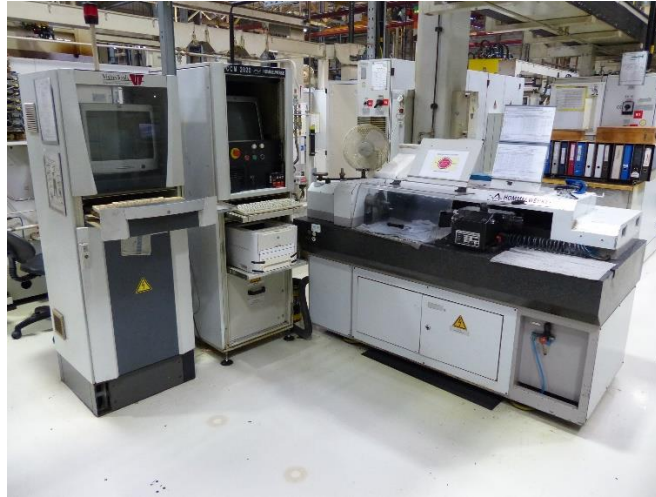
OP 60 HOMMELWERKE FormTester